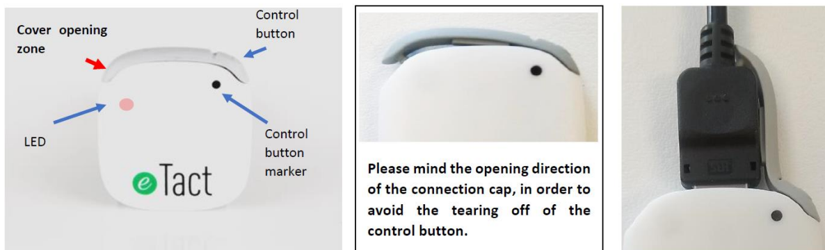
Picture 1 : Description of eTact and its wire connection with the dedicated cable delivered with the system.